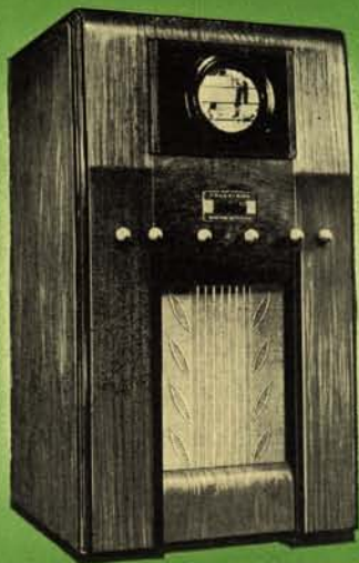
TABLE MODEL HM-171

High Definition Television Receiver. 5" Picture Tube. Cabinet—height 38"—width 23"—depth 17 \frac{3}{4} ". 18 tubes (including picture tube).